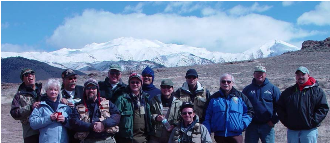
Squaw Creek Group—March 19, 2006